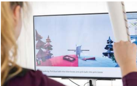
Example task: balance balls into their targets with your arms

VAST.Rehab uses a wide variety of therapeutic tasks to enable training in all rehabilitation domains: