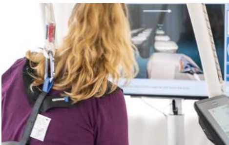
Example task: steer the spaceship via your upper body movement