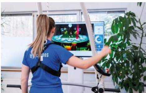
Dual tasking including the upper limbs for a full body workout on a treadmill